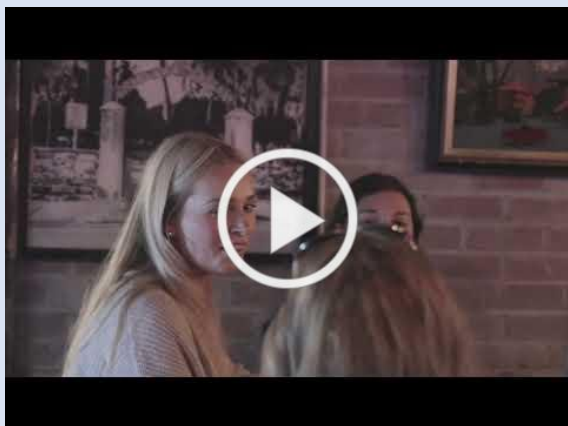
The RGCO Team at our